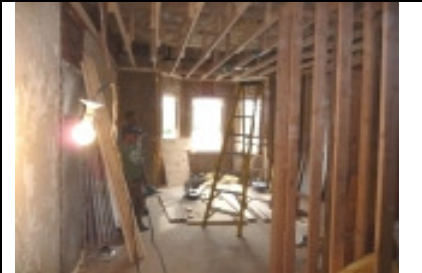
Property during renovation