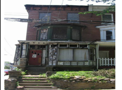
Property before renovation

Address: 4620 Greene Street Philadelphia, PA 19144 Three Story Brick Row/Corner Property Gross Area: Living Area of 2,688 sq feet Duplex/Two Units Unit # 1/ 1st floor of 896 sq feet with 5 rooms: Living room Dining room Kitchen Bathroom Bedroom New Mechanical Systems Unit # 2/ 2 nd & 3 rd floor/ Bi level of 1,792 sq feet with 8 rooms: Living room Dining room Kitchen 2 Bathrooms 3 Bedrooms New Mechanical Systems Basement/with separate exterior entrance (unfinished) Rear yard / 400 sq feet Property available in July 2012 An income producing property Total renovation with new energy efficient systems Central Air Conditioning Separate Utilities Owner Occupied Sale Price: $ 172,000 Property Tax (estimated): $ 1,300 per year Contact Information: Jamal Pitts Keller Williams Realty (610) 521-0101 ext 6515