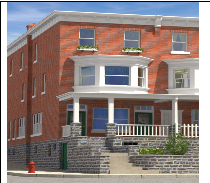
4620 Greene Street